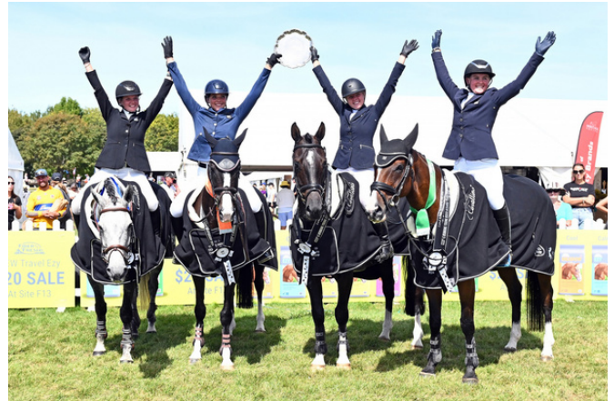
New Zealand Young Rider team - Oceana Challenge