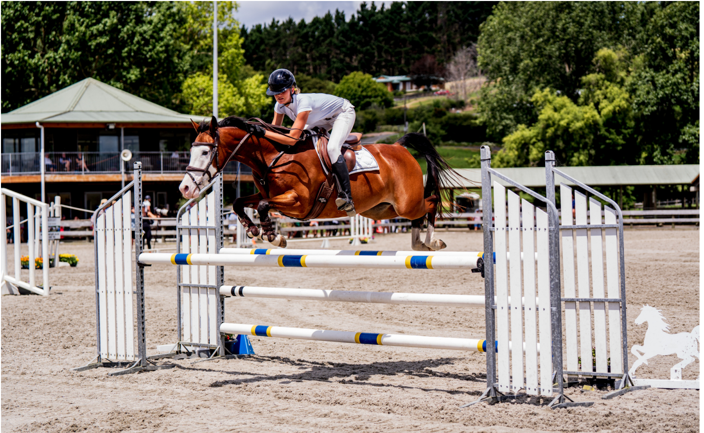
Piper Lodder & Daisy Dream